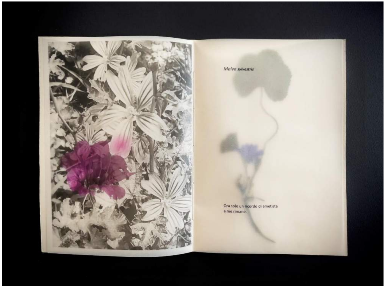
Malva – E. Dickinson – J 245 / F 261 Ora solo un ricordo di ametista / a me rimane